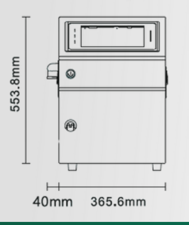
Host facing up